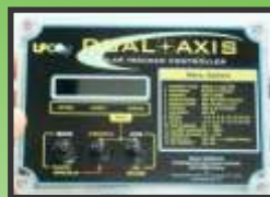
STA2000-HW Controller with Bright LCD Real-Time Status Display.